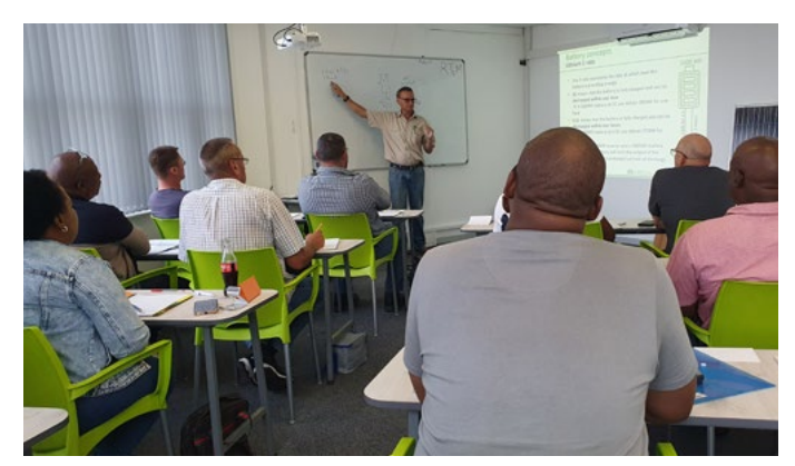
Join our course and meet fellow entrepreneurs